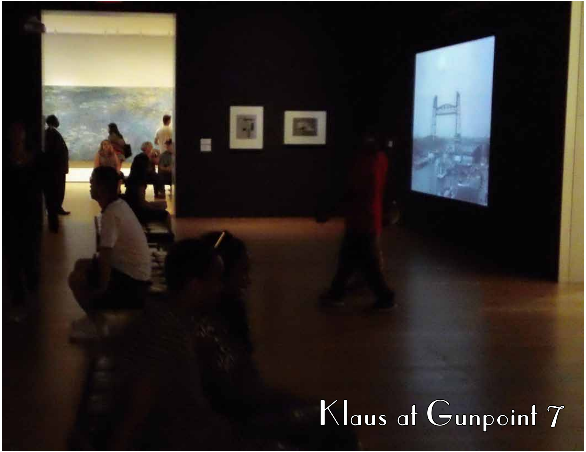
Klaus at Gunpoint 7