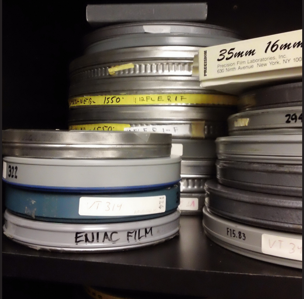
Klaus at Gunpoint 5